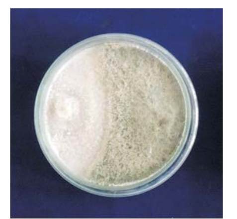
Figure 1: Antagonistic activity of Trichoderma isolate (Tv-23) against Pythium in dual culture technique

Soil samples were collected from major turmeric and ginger growing areas of Belagavi (Gokak, Raybag) and Bagalkot