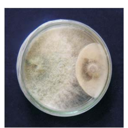
Figure 3b: Antagonistic activity of Trichoderma isolate (Tv-17) against Rhizoctonia in dual culture technique