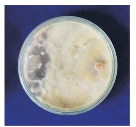
Figure 4: Antagonistic activity of Trichoderma isolate (Th-25) against Sclerotium in dual culture technique

* Original values; **Figures in parenthesis are arcsine transformed values