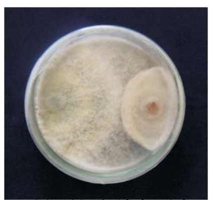
Figure 3a: Antagonistic activity of Trichoderma isolate (Tv-2) against Rhizoctonia in dual culture technique